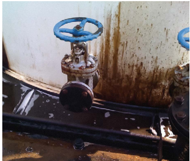
Fig. 2. BioEase 2305 was used to clean a small section of a vertical tank wall covered with oil. Where BioEase 2305 was applied, the tank was restored to its original white color with minimal scrubbing.